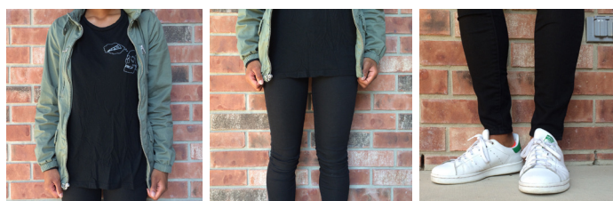
SHIRT: PacSun JACKET: Gap PANTS: PacSun SHOES: Adidas