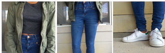
SHIRT: PacSun JACKET: Gap PANTS: Cotton On SHOES: Adidas