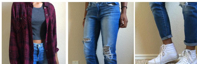
SHIRT: PacSun FLANNEL: PacSun JEANS: A'GACI SHOES: Vans