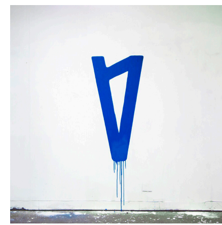
Lauv - I met you when I was 18. (the playlist) Favorite Track: Comfortable