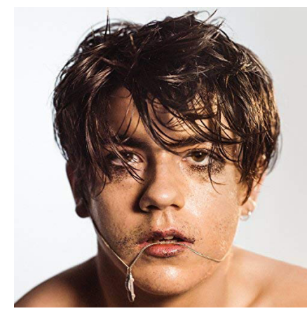
Declan McKenna - What Do You Think About the Car? Favorite Track: Why Do You Feel So Down