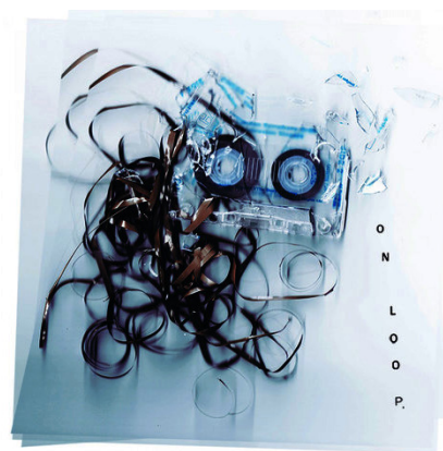
Little Sea - On Loop Favorite Track: Loop