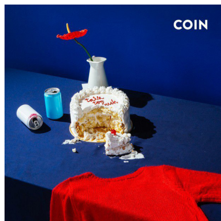
COIN - Talk Too Much (single)