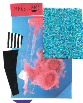
Marsicans - Arms of another (single)